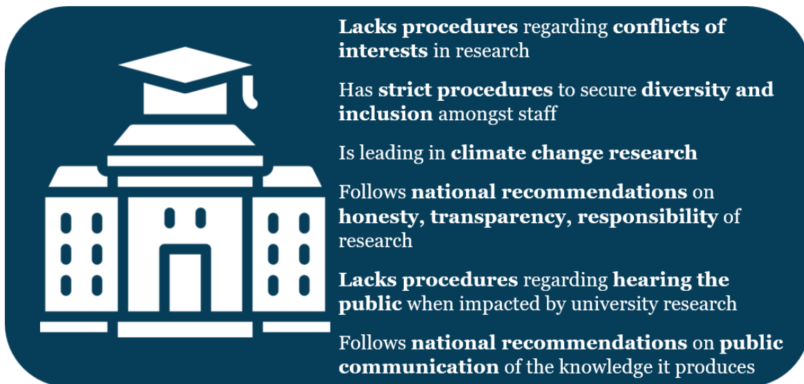
Figure 1: Example vignette

Notes: An example of a university profile the level as well as the variable is in bold for ease of evaluation.